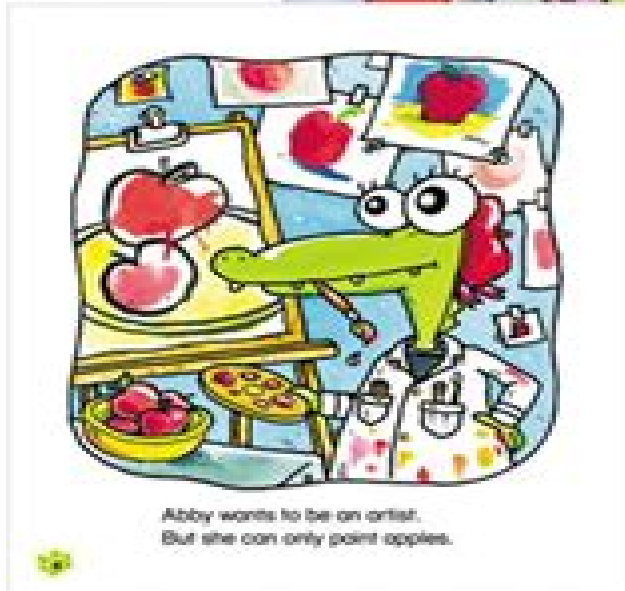
Abby wants to be an artist. But she can only point apples.